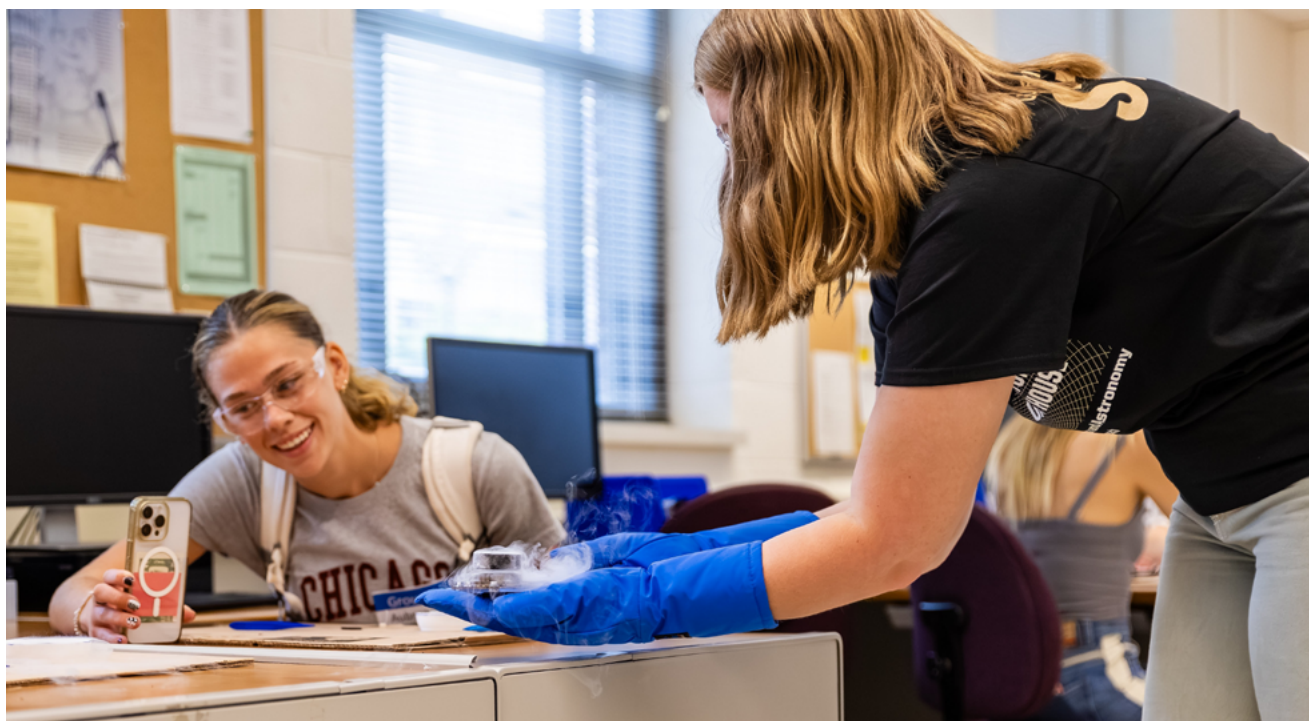
Above: Purdue's Quantum Open House.