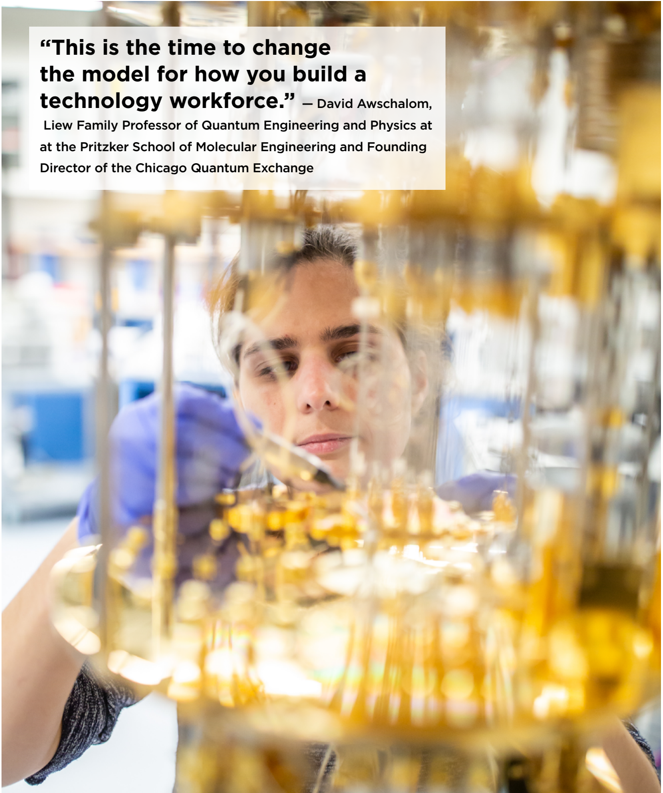
Above: A lab at the University of Chicago's Pritzker School of Molecular Engineering, which launched one of the first PhD programs in quantum science and engineering.