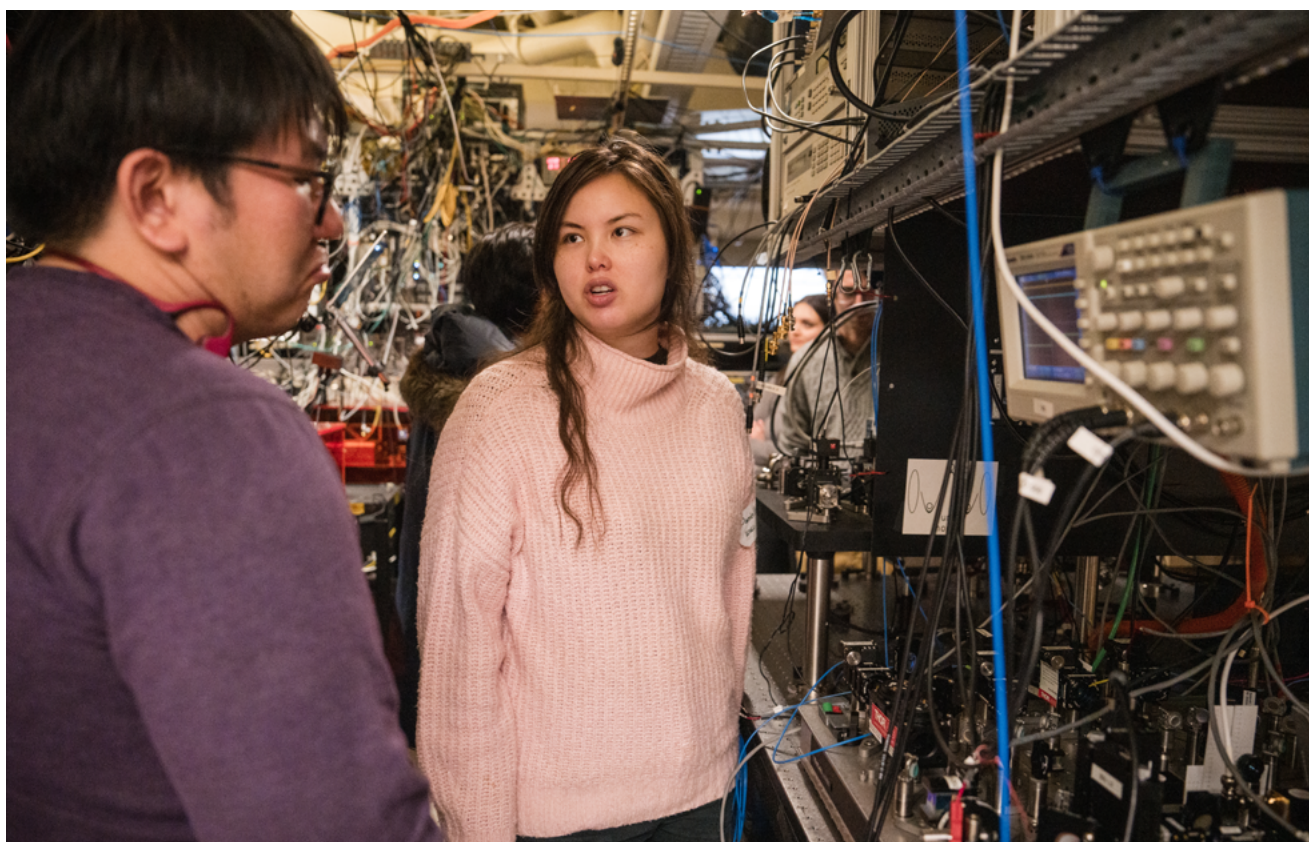
Above: A quantum lab at the University of Wisconsin–Madison.

This research ecosystem is supported by a deep and diverse talent pipeline. Universities across Illinois, Wisconsin, and Indiana collectively graduate roughly 2,200 PhD students and 14,000 master’s degree students annually in disciplines such as electrical engineering, computer science, physics, and materials science. These programs feed into one of the largest concentrations of quantum-relevant research and development activity in the world. Colleges across the region also produce more than 31,000 undergraduate degrees annually in quantum-relevant disciplines, forming the core pipeline into graduate study and quantum research careers. Community and technical college systems across the three states further strengthen this pipeline. Across Illinois, Wisconsin, and Indiana, these systems collectively serve more than one million learners across degree and non-degree programs, providing entry points into engineering and technical programs and acting as key transfer partners for students continuing into four-year institutions. These pathways expand access to the engineering, computing, and physical science disciplines that underpin the quantum workforce.