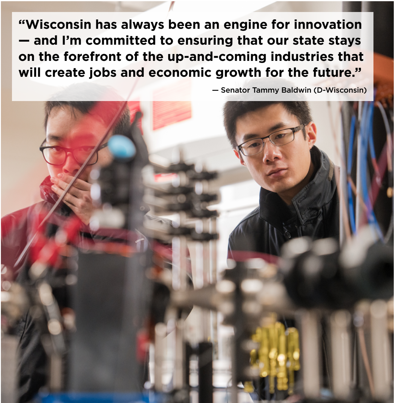
Above: A quantum lab at the University of Wisconsin–Madison.