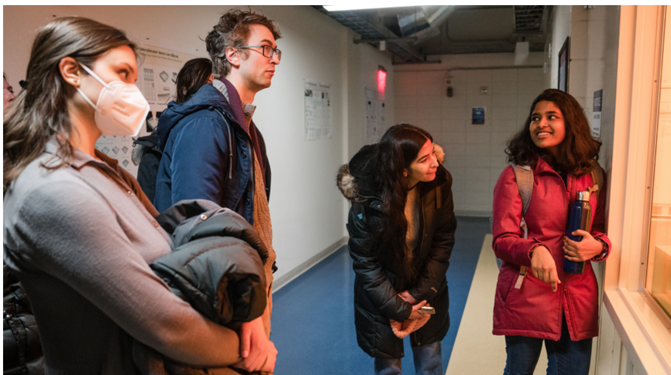
Above: A tour of quantum labs at the University of Wisconsin–Madison.