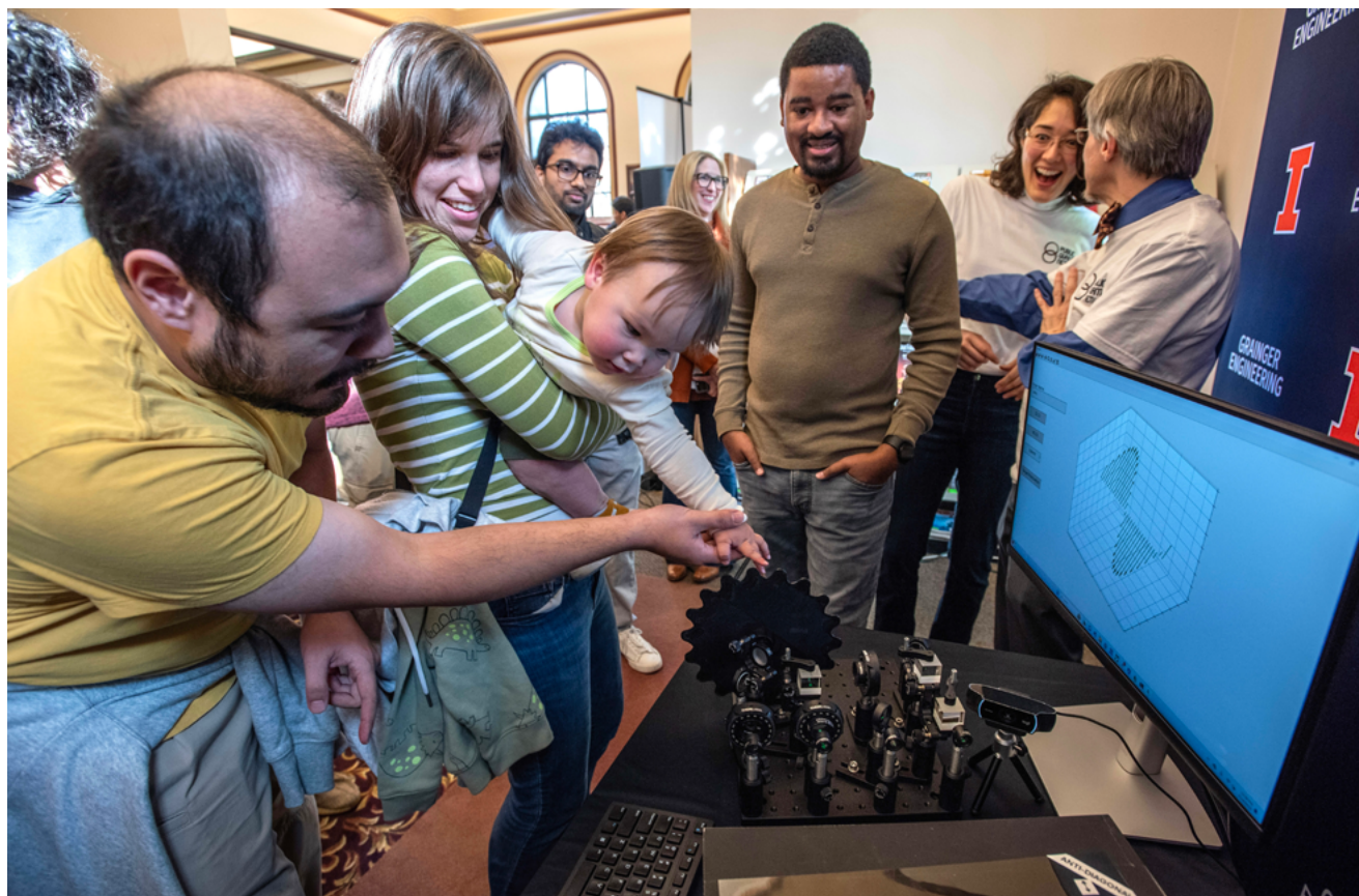
Above: The University of Illinois Urbana-Champaign's Public Quantum Network launched in 2023 at the Urbana Free Library to expand awareness of quantum technologies. Visitors of all ages can run hands-on quantum measurements and explore phenomena like entanglement for themselves.