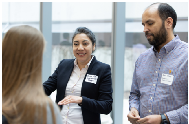
Above: Undergraduate and graduate students meet with employers at the annual Chicago Quantum Recruiting Forum.