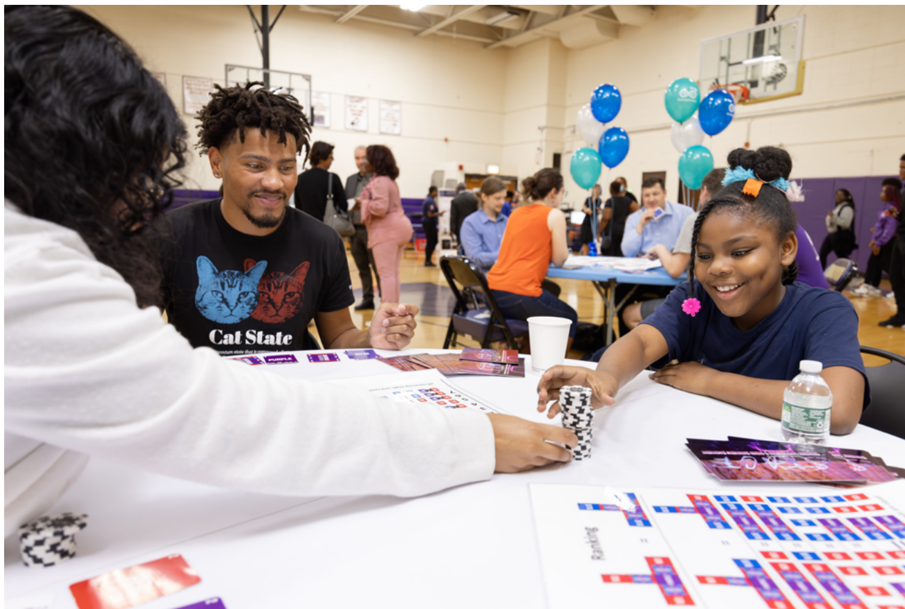
Above: A Quantum Game Night held at Chicago's Bowen High School in 2024 helped introduce young people and their parents to quantum science — an important first step in scaling the future quantum workforce.

Across both domains, success depends on attention to detail, communication, coordination across multidisciplinary teams, and strong workplace-safety practices, ensuring that quantum environments and components are built to rigorous technical and operational standards.