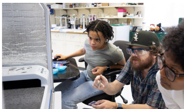
Top: Students view a dilution refrigerator as part of the US Quantum Information Science Summer School, hosted at the US Department of Energy’s Fermi National Accelerator Laboratory in 2023.